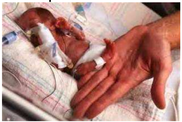
Still, the doctor's soft words dropped like bombs.

"I don't think she's going to make it," he said, as kindly as he could.