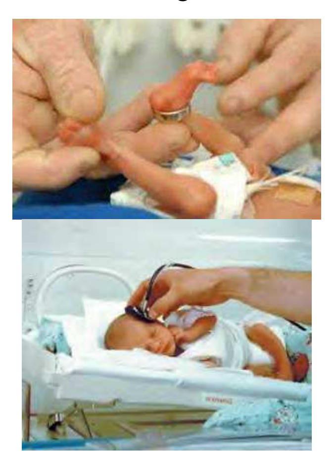
But as the weeks went by,

There was never a moment when Dana suddenly grew stronger.