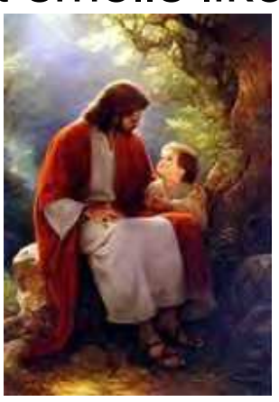
announced, "No, it smells like Him.

It smells like God when you lay your head on His chest."